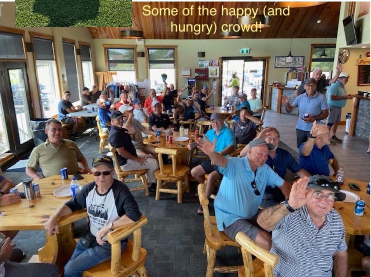
Some of the happy (and hungry) crowd!