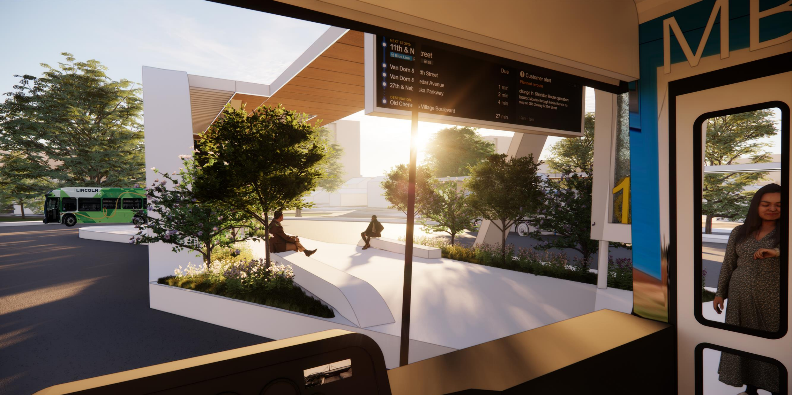
Covered waiting area and wayfinding signage.