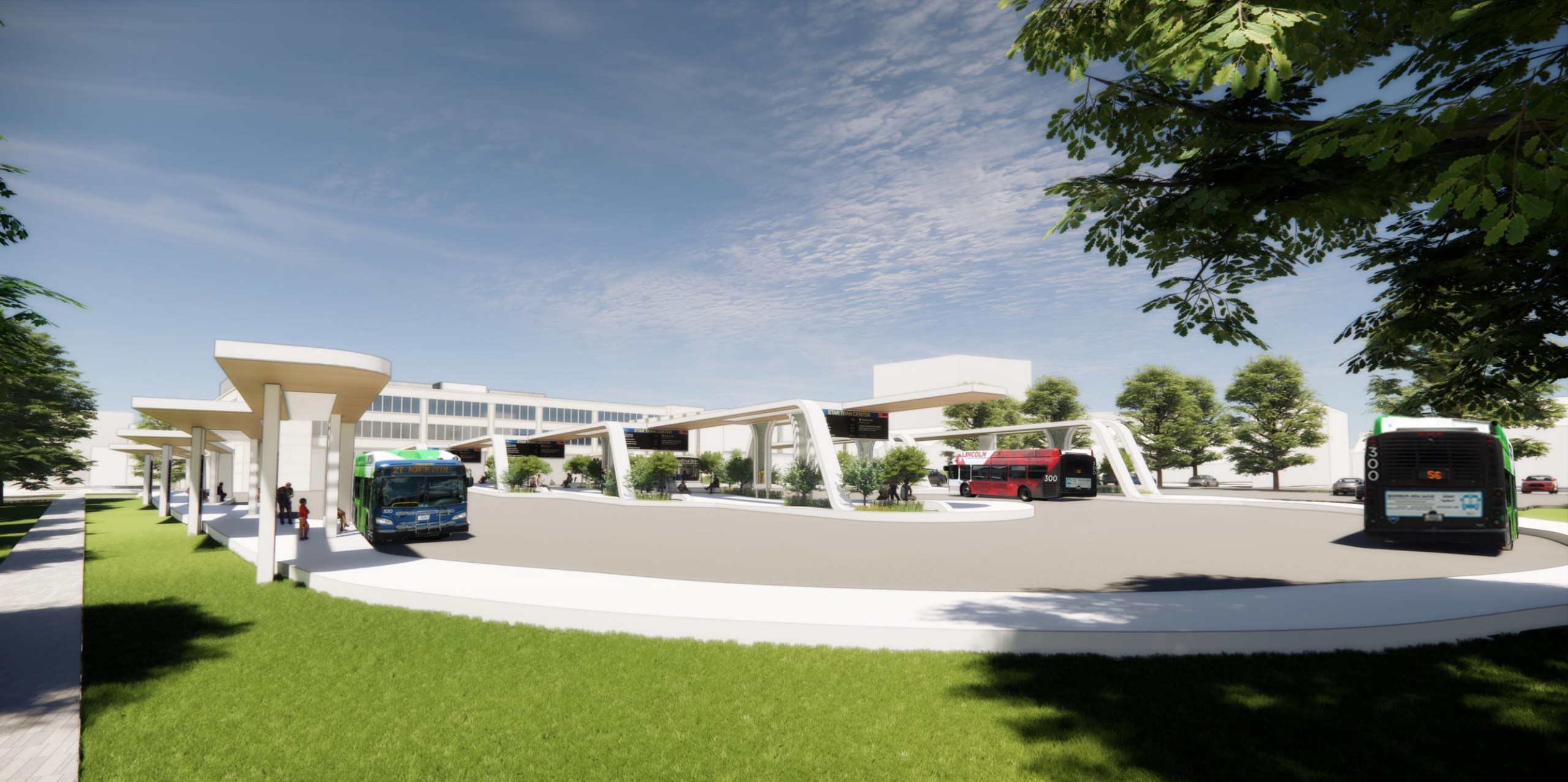
Bus bays from the corner of 9th and G streets looking northeast.