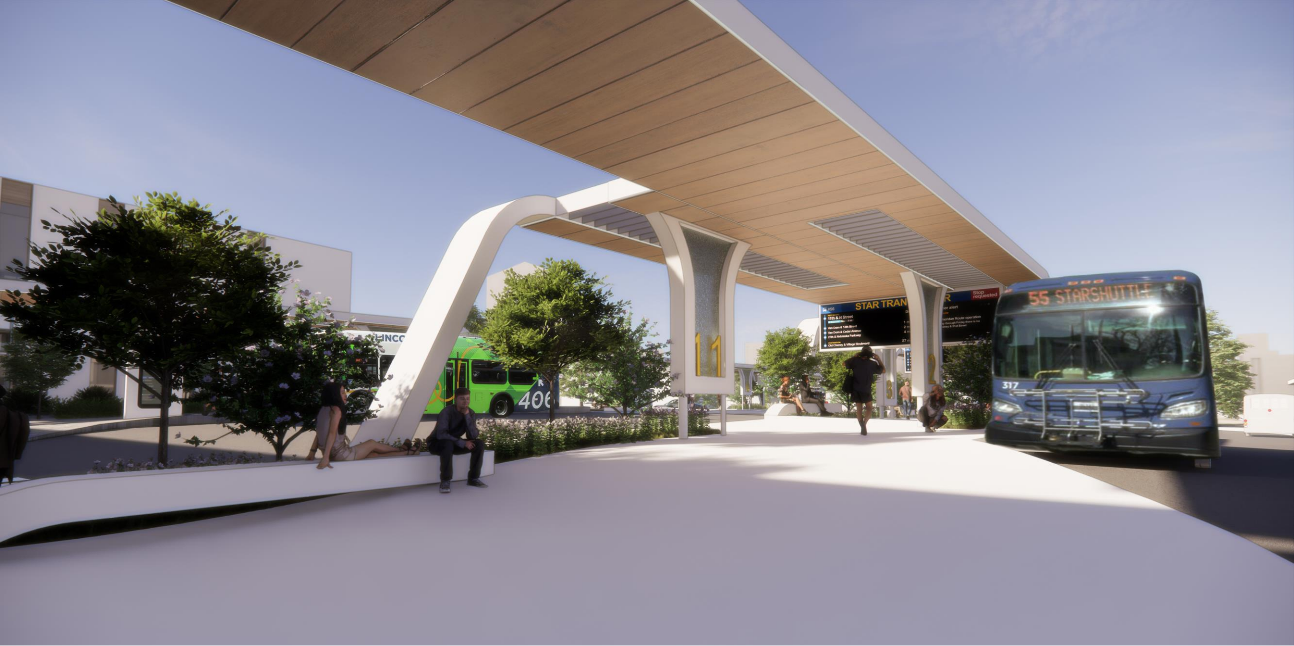
Bus bays with covered waiting area and wayfinding signage.