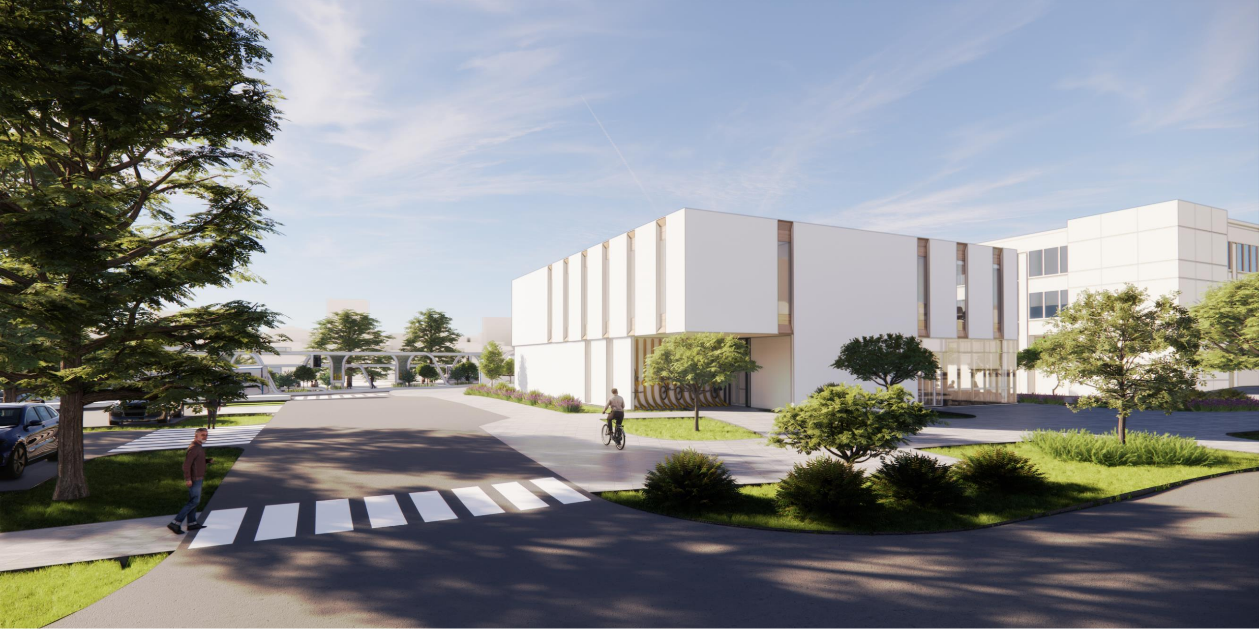
View from 10th Street looking west.